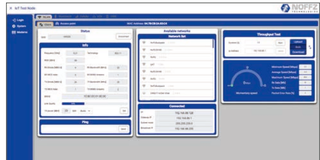
WebGUI for easy access, prototyping and benchtop application

IoT Test Node is designed for automated test, you can reach all functions through a modern, platform-independent API, but for benchtop applications just use the webUI out of the box.