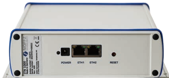
IoT Test Node for WLAN and Bluetooth™ with SMA connectors for RF and Ethernet (PoE) to control