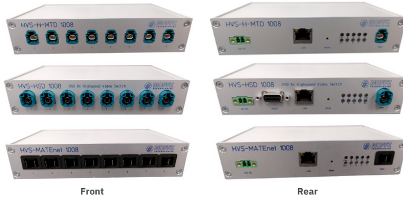
NOFFZ HDS with different automotive connectors like HSD, MATeNet & H-MTD