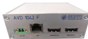
NOFFZ Automotive Video Serializer/Deserializer