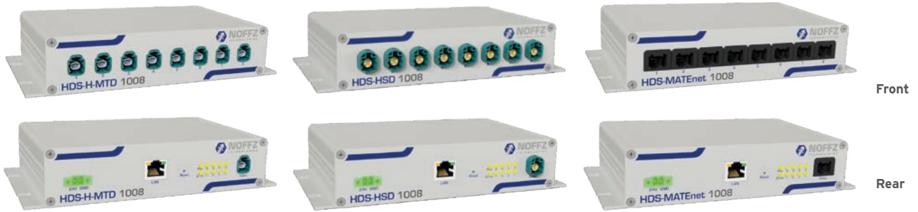
NOFFZ HDS with different automotive connectors like HSD, MATeNet & H-MTD